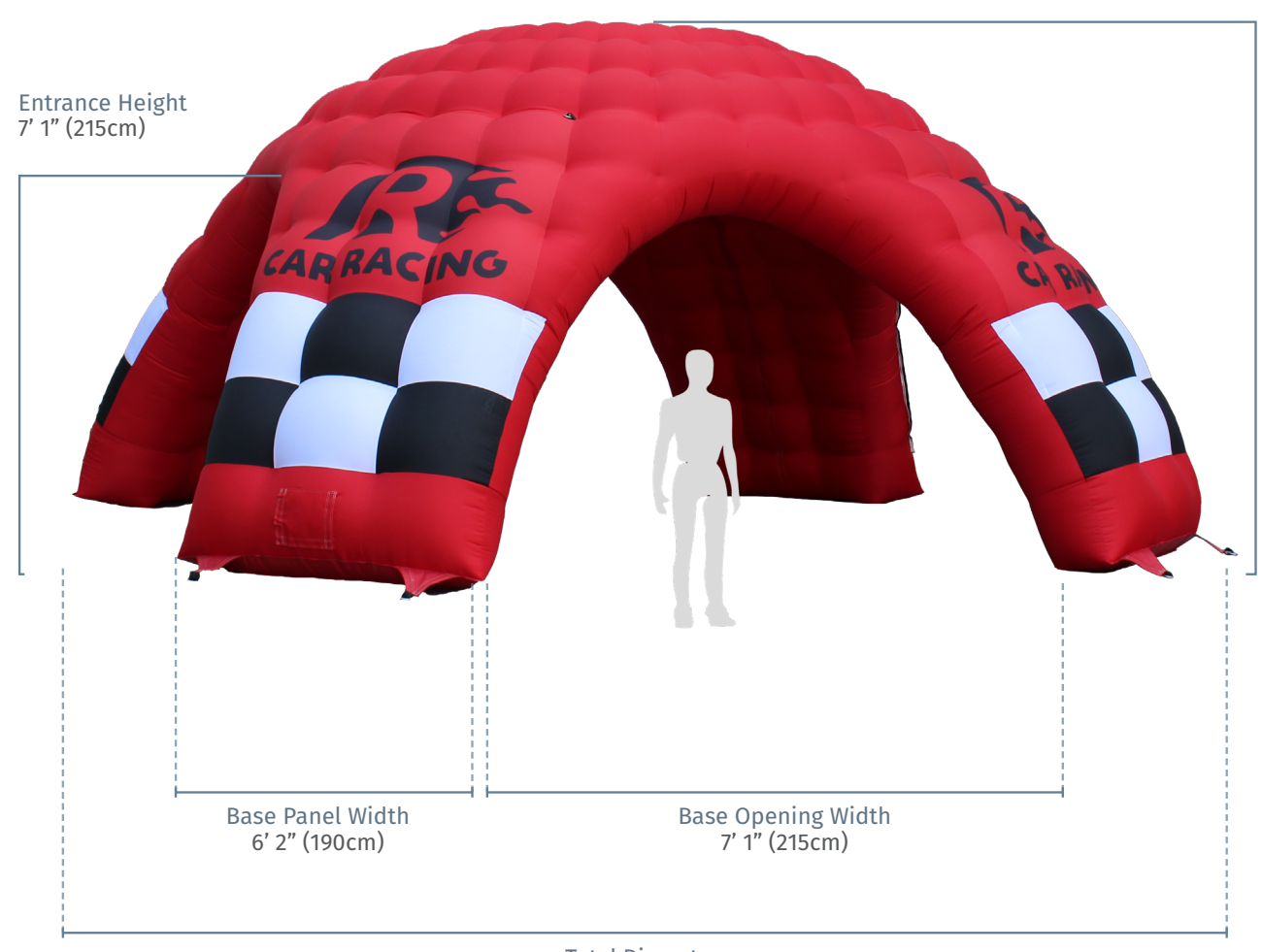
Total Diameter 20' (615cm)