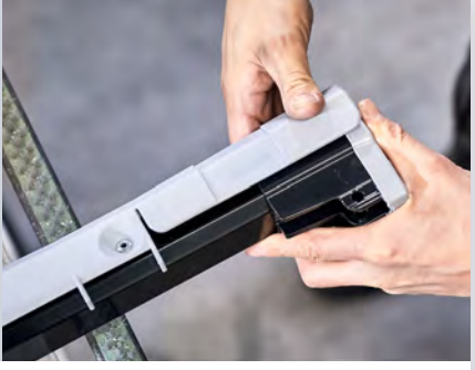
Patented Tensioning System

With a third the weight of steel, our tents use all-aluminum parts for a stronger build from peak to footplate.