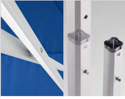
Smooth Set-Up Details

Keep rooflines tight and valances smooth with our integrated corner clips - a feature missing from common tents.