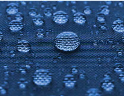
Pirontex® & Waterproof Fabrics

To avoid wear, we equip rubber caps and PVC fabric reinforcements at all contact zones between frame and roof.