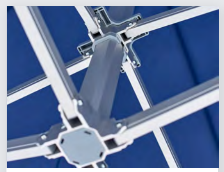
Robust, All-Aluminum Design

With a third the weight of steel, our tents use all-aluminum parts for a stronger build from peak to footplate.