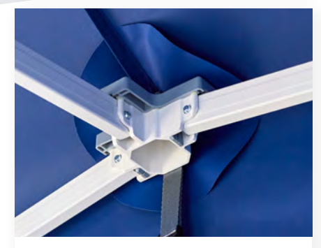
Frame & Fabric Protection

Tent trusses and telescoping legs are equipped with integrated separators to prevent metal-on-metal scraping.