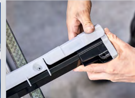
Patented Tensioning System

In extension of our durable frame design, the outside tensioning pieces keep your tent roof looking sharp.