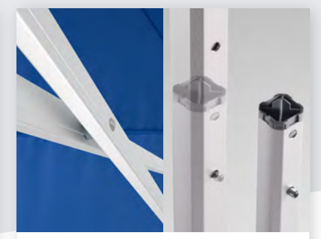
Smooth Set-Up Details

Keep rooflines tight and valances smooth with our integrated corner clips - a feature missing from common tents.