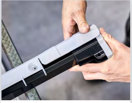
Patented Tensioning System

With a third the weight of steel, our tents use all-aluminum parts for a stronger build from peak to footplate.