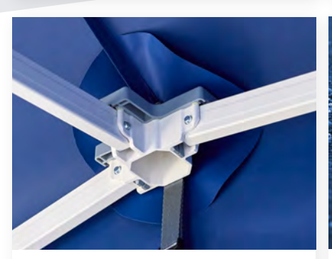
Frame & Fabric Protection

Tent trusses and telescoping legs are equipped with integrated separators to prevent metal-on-metal scraping.