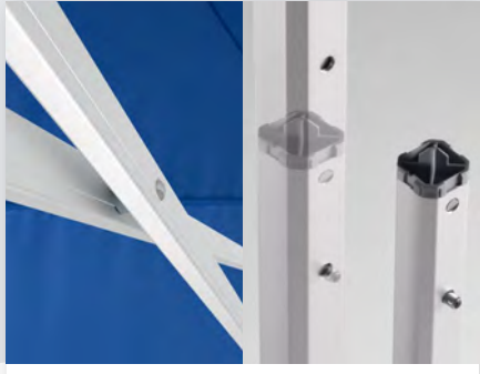
Smooth Set-Up Details

Keep rooflines tight and valances smooth with our integrated corner clips - a feature missing from common tents.