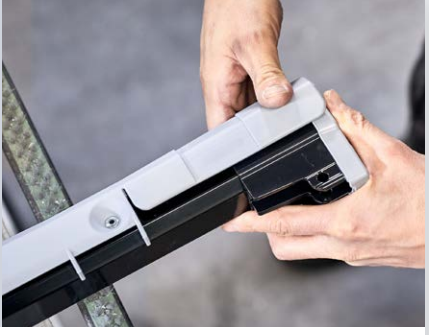
Patented Tensioning System

With a third the weight of steel, our tents use all-aluminum parts for a stronger build from peak to footplate.