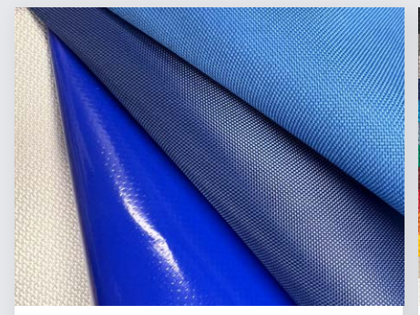
Premium Fabric Options

Choose from our signature Pirontex® ultra-durable fabric, double-weave Oxford, PVC, and Fiberglass options.