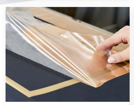
Heat Transfer Printing

In our ongoing attention to detail, all stitching, trim, and Velcro are color-matched to your tent fabric.