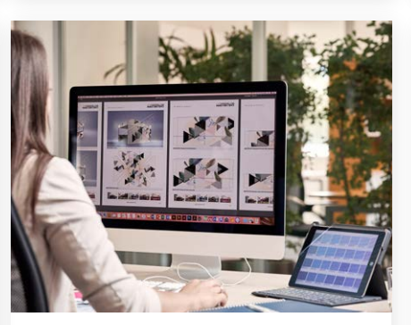
In-House Design Services

Show off with complete edge-to-edge printing! Perfect for custom colors, patterns, and maximum impact.