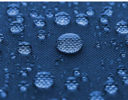
Pirontex® & Waterproof Fabrics

To avoid wear, we equip rubber caps and PVC fabric reinforcements at all contact zones between frame and roof.