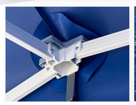
Frame & Fabric Protection

Tent trusses and telescoping legs are equipped with integrated separators to prevent metal-on-metal scraping.