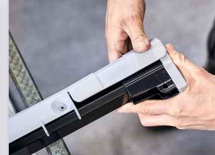
Patented Tensioning System

In extension of our durable frame design, the outside tensioning pieces keep your tent roof looking sharp.