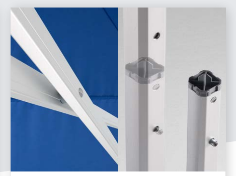
Smooth Set-Up Details

Keep rooflines tight and valances smooth with our integrated corner clips - a feature missing from common tents.