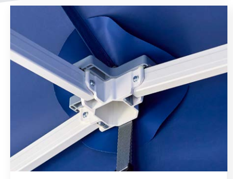
Frame & Fabric Protection

Tent trusses and telescoping legs are equipped with integrated separators to prevent metal-on-metal scraping.