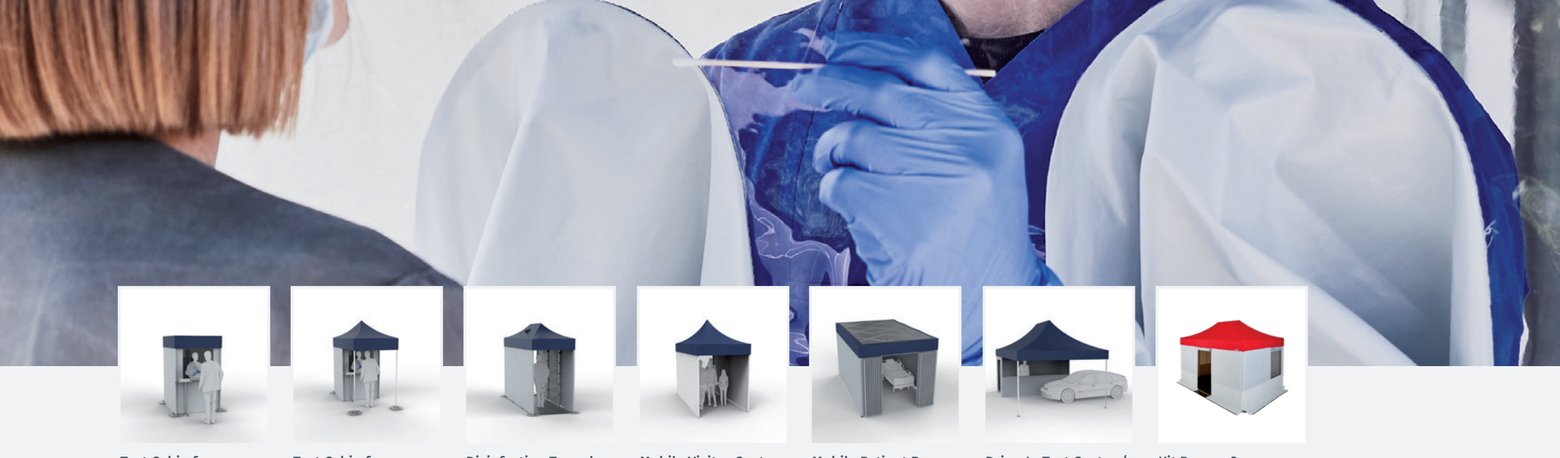
Test Cabin for Indoor Use Page 3